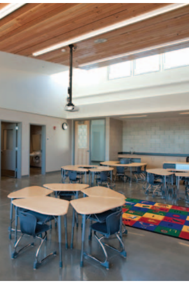
Classroom daylighting can positively impact students' health and development.

Many of the efficiency measures used in the school were based on recommendations in the Advanced Energy Design Guide for K-12 School Buildings , an energy efficiency guide developed by DOE and NREL in collaboration with national professional societies.