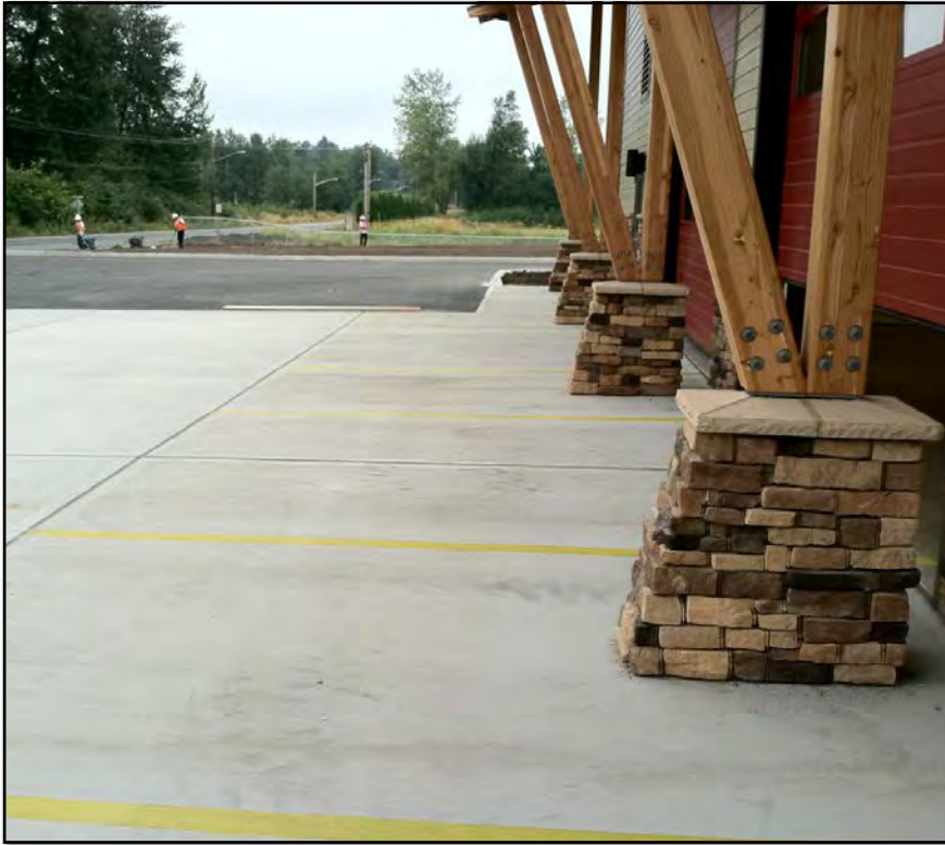
ALL IMAGES COPYRIGHTED GREEN UMBRELLA © 2/19