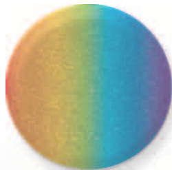
CUSTOM COLOR AVAILABLE