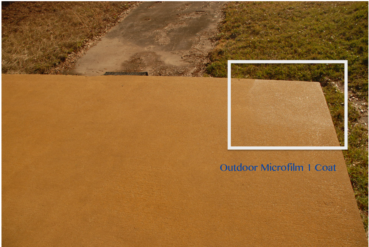
Outdoor Microfilm 1 Coat