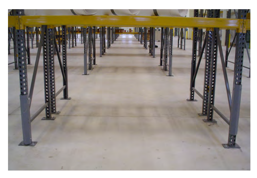
Fig. 4. Workplace safety: white concrete floors work well in industrial settings, too. The light color reduces shadows and improves lighting efficiency in large buildings, such as warehouses.

Advancements in surface treatments and admixtures have simplified the casting of architectural concrete and expanded possibilities. Finishes that expose the matrix of the concrete by polishing, acid etching, chemically retarding, and sandblasting are becoming more common. In precast applications, white cement is sometimes used exclusively in the exposed layer, producing a decorative facing mix that is just a few inches thick.