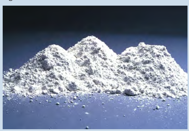
Fig. 1. White cement is subject to exacting quality control procedures that minimize color variation during manufacturing. This provides a neutral base for concrete finishes whether they are white or tinted.

All white cements manufactured in North America are made to strict standards to meet customer needs. Color is an especially important quality control issue in the white cement industry, where consistency in brightness and tone are principal concerns. The color of white cement depends on both the raw materials and the manufacturing process. Metal oxides (iron, manganese, and others) that are present in the finished material influence its whiteness and undertone, making it imperative to use carefully selected raw materials (See Figure 1).