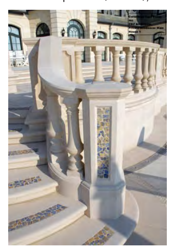
Fig. 8. The fine texture, intricate detail, and excellent color consistency are hallmarks of Cast Stone.

to masonry and decorative cast items, finishes are colored by using a combination of white cement and pigments. Ornamental concrete pieces are used as building accents (see Figure 8). One well known product for this purpose is Cast Stone, a mixture of fine and coarse aggregates, portland cement, pigments, chemical admixtures and water. Cast Stone is a masonry product,