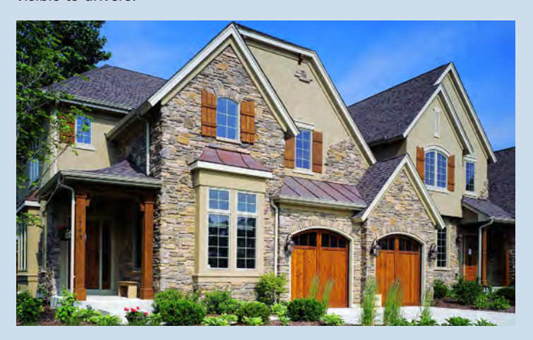
Fig. 6. Fire safety: the façade of this residence combines two noncombustible finishes, portland cement plaster (stucco) and manufactured stone veneer products, for an attractive appearance. These products are frequently made with white cement.