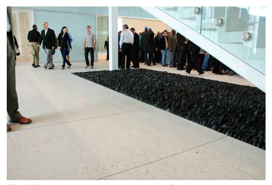
Fig. 3. Polished and elegant white cement concrete floors complement white concrete walls in the Tampa Museum of Art, and are durable under heavy foot traffic.

Architectural concrete products such as masonry block and Cast Stone commonly incorporate white cement. An advantage of specifying these products in white cement tones is the wide range of complementing mortar materials that can be specified to tie projects together in a distinctive design.