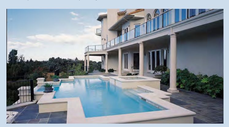
Fig. 7. Pool safety: White or light-colored surfaces offer the most safety for high visibility in pools. Plaster finishes for swimming pools provide long life and low maintenance.

For transportation projects, white or colored concrete creates a strong visual contrast and offers an opportunity for passive traffic safety. Median ("Jersey") barriers made of white concrete not only physically separate vehicles from hazards, but are highly visible, even at night and in wet conditions. These barriers are made either as cast-in-place or precast concrete elements. Light colored elements in roadways provide a traffic calming effect that increases safety for all modes of transportation (see Figure 5).